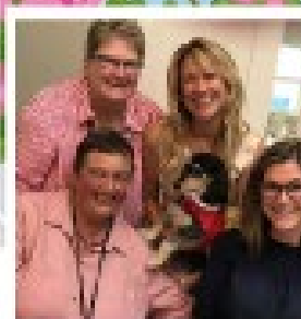
Even dogs like to stay with the Wayside House team.

We also offer Equine Therapy, Psychoedms, individualized therapy, family counseling and other groups to help clients understand SUD and learn skills to stay clean and sober.